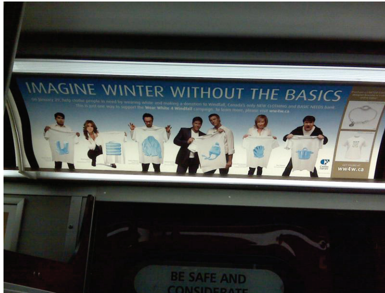
The WW4W celebrity poster on the TTC