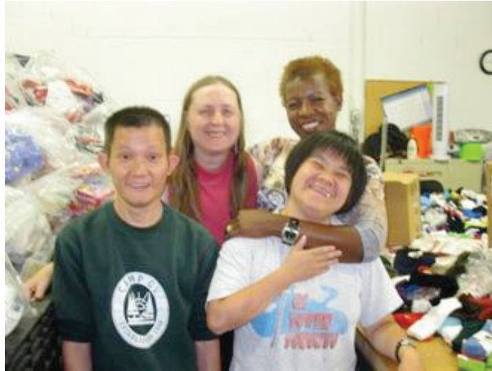
Team members from Community Living Toronto