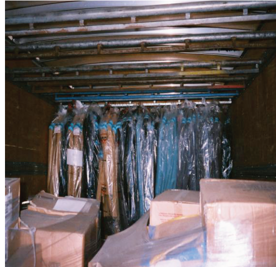
A peek inside a Remco truck