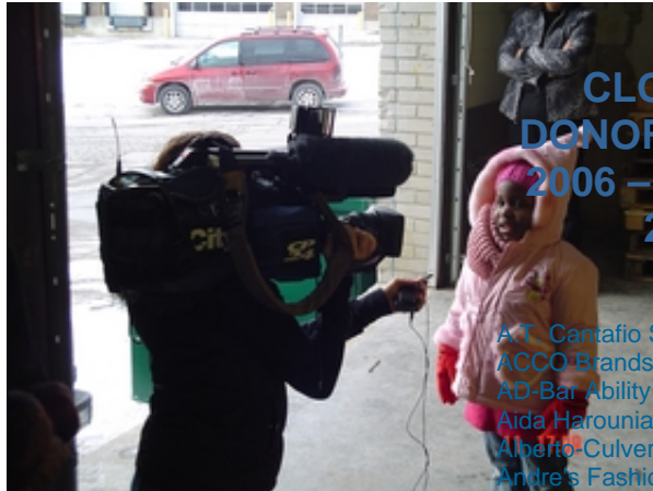
Young client who received a snowsuit during media interview.