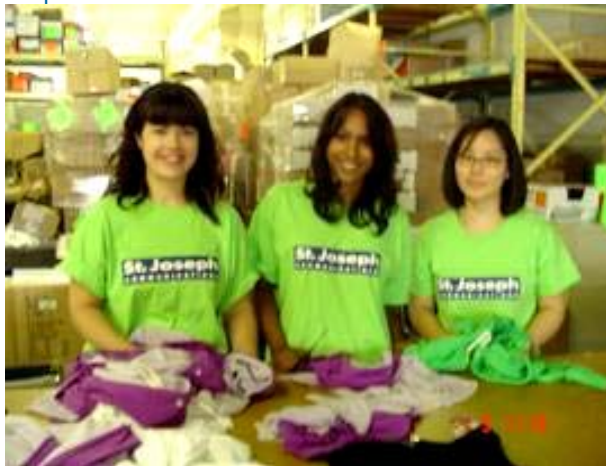
Employees of St. Joseph Communications helping out on their volunteer day.

SPECIAL SUPPORT: STYLE Magazine, Canadian Apparel Federation, Harmony Printing, Chris Steer Insurance, Toronto Community Foundation, Remco Group.