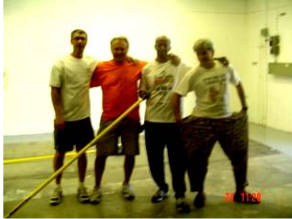
Directors and shareholders of OceanLake Commerce painting the warehouse.